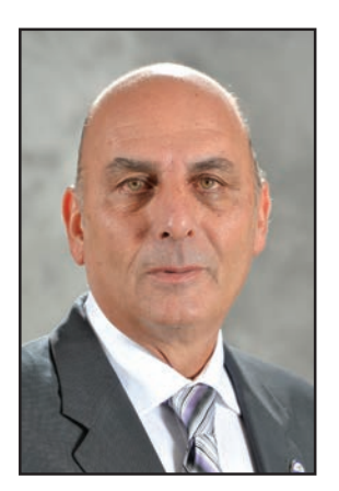
RETIREMENT, PROMOTION AND APPOINTMENTS IN NPMHU

NATIONAL HEADQUARTERS: 815 16<sup>th</sup> Street, N.W. • Suite 5100 • Washington, D.C. 20006 • (202) 833-9095